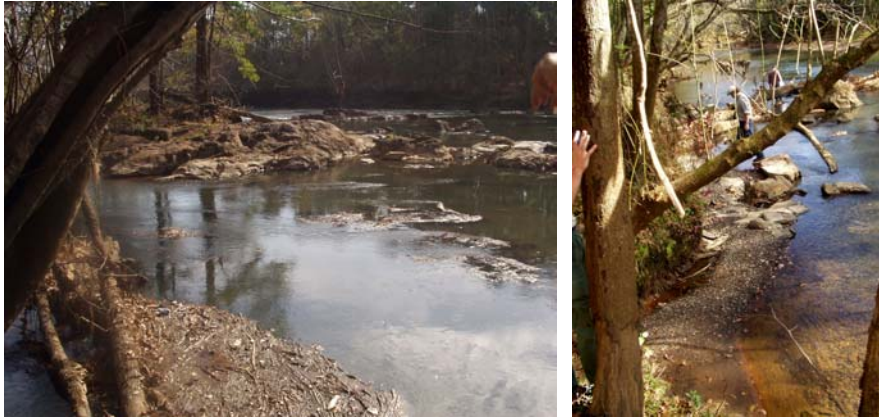
Photos 5 and 6. Upstream tip of Corley's Island with shoal in main channel ( distant in the photo ), and object cover and substrates in upper portion of side channel.

Corley's Island. Ron Ahle believes that this feature has been present for at least ten years.