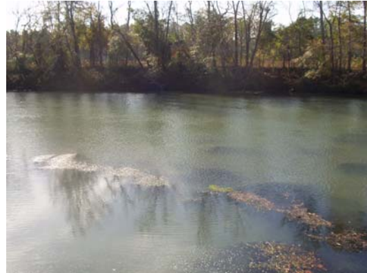
Photos 2 and 3. Views of run mesohabitat and aquatic vegetation at Saluda Shoals.

The team also identified areas that appear to be riverine pools in this segment. There are also a few scattered riffles exposed at this flow, comprised primarily of exposed large boulders and possible tips of some bedrock surrounded by fines such as sand and small gravels (Photo 4). Rawls Creek joins the Saluda River in this segment and marks the beginning of Reach 2.