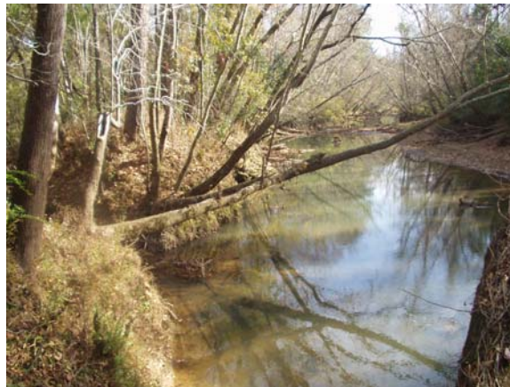
Photo 7. Lower portion of side channel at Corley's Island.

Oh Brother Rapids/Ocean Boulevard. This site is located where the river begins to descend the fall line (upper end of Reach 3), which is the transition between Piedmont and Coastal Plain geomorphic provinces. Thus gradient and substrates are more pronounced than in the upstream sites. The group accessed the river via private property with a right of way provided by Trout Unlimited. This site is more hydraulically complex than upstream areas. An island forms two channels that descend through bedrock shoals, with the Oh Brother Rapids channel appearing to be the secondary, possibly newer channel. There is at least one cross-cutting channel traversing the main island, and braided areas below the larger main island. (Photo 8).