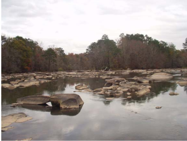
Photo 14. View looking downstream from Riverbanks Zoo, across pool to the crest of Shandon Rapids. Island in center ( indicated by tall trees ) creates steep gradient braided channels.