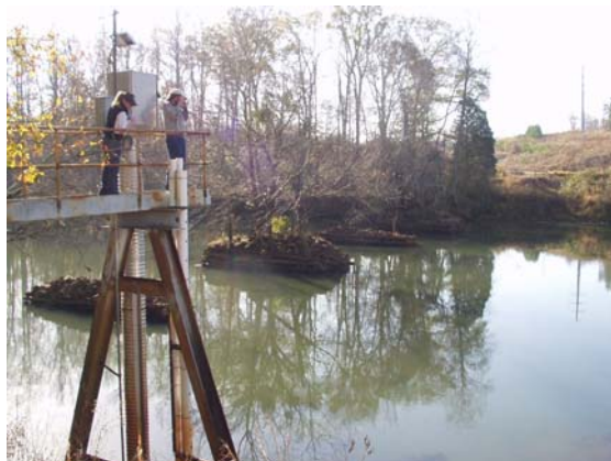
Photo 1. Run habitat and USGS gage below Lake Murray outlet

USGS Gage site. This site is located in Reach 1 above the confluence with the overflow channel, It features steep vegetated banks, and laminar flow, and bank width of approximately 100 ft.. Channel bottom appeared relatively even with fines and scattered object cover. Bridge piers are evident just below the gaging station (Photo 1). Based on the mesohabitat definitions, the group agreed that this site represented a run at this flow.