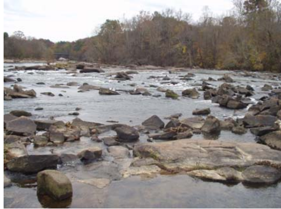
Photos 11 and 12. Millrace Rapids. Views looking upstream (Photo 11) and downstream (Photo 12).

Riverbanks Zoo. The group viewed a pool/run/rapids complex at the downstream end of the Riverbanks Zoo property. This area featured large object cover (decomposed boulder and ledge substrates dominated), and a large pool that is clearly ledge-controlled. The team viewed the upper segment of Shandon Rapids, which appears to be shoal habitat that descend to the Broad River through a braided channel with large boulder substrates (photos 13 and 14).