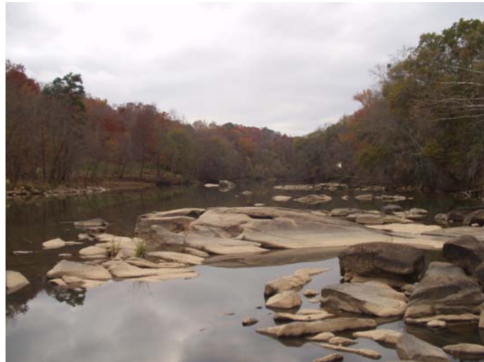
Photo 13. Pool and object cover area looking upstream at Riverbanks Zoo site.

Riverbanks Zoo. The group viewed a pool/run/rapids complex at the downstream end of the Riverbanks Zoo property. This area featured large object cover (decomposed boulder and ledge substrates dominated), and a large pool that is clearly ledge-controlled. The team viewed the upper segment of Shandon Rapids, which appears to be shoal habitat that descend to the Broad River through a braided channel with large boulder substrates (photos 13 and 14).