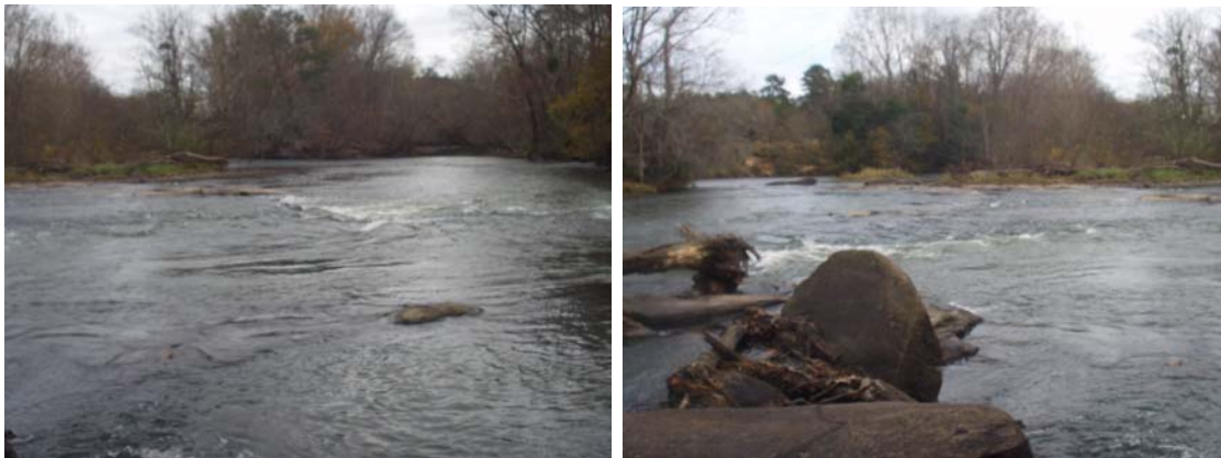
Photos 9 and 10. Oh Brother Rapids: Example of riffle/shoal/substrate and braided channels.

Millrace Rapids. This marks the upstream boundary of Reach 4. The river channel width increases at this point, and there are multiple braids and interstitial flow passing between and under large boulder and broken rubble remains of a former masonry dam (Photos 11 and 12). It was noted that a plunge-pool exists at the toe of the rapids, and the team agreed that an empirical rather than PHABSIM-model approach would be preferred to characterize hydraulics at this location. Kayakers were observed navigating the rapids at this flow.