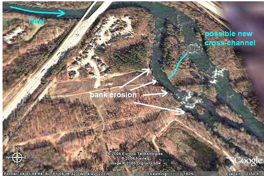
Photo 8. Oh Brother Rapids/Ocean Boulevard.

potential concern for the study if the channel is continuing to change in ways that would affect the accuracy of any modeling results obtained here. After discussion, it was agreed that input from a geomorphologist would help the team draw firmer conclusions about options and/or caveats for the modeling scope for this segment.